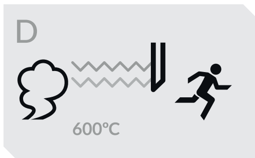
FIRE RESISTANCE CLASS

Fixed Smoke Curtains GSF KDS are used as barriers to control the movement and spread of smoke generated by a fire. Their function is to create a reservoir of smoke, directing it to a specific location. They are also responsible for preventing or delaying the flow of smoke into other areas enabling effective evacuation. Smoke curtains are mainly used in large commercial buildings such as shopping centers, warehouses or industrial halls. All our smoke curtains are CE marked and tested according to European standards EN 12101-1:2005+A1: 2006.